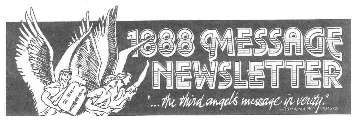
Volume 4, Number 1